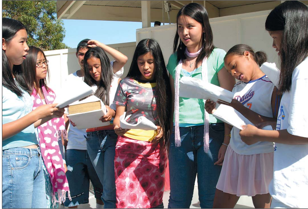
In rehearsal: students at Inside Out's 2005 Theatre Project campout in the Santa Monica Mountains.